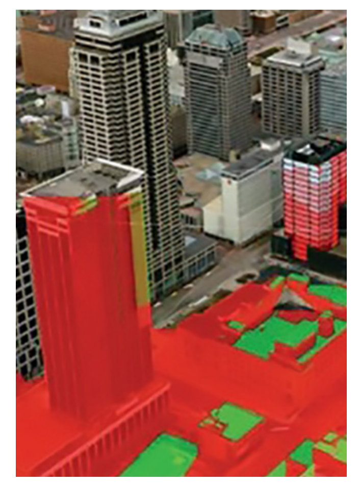
Gain better insight into the impact of change on the environment, based on a realistic understanding of real-world parameters.