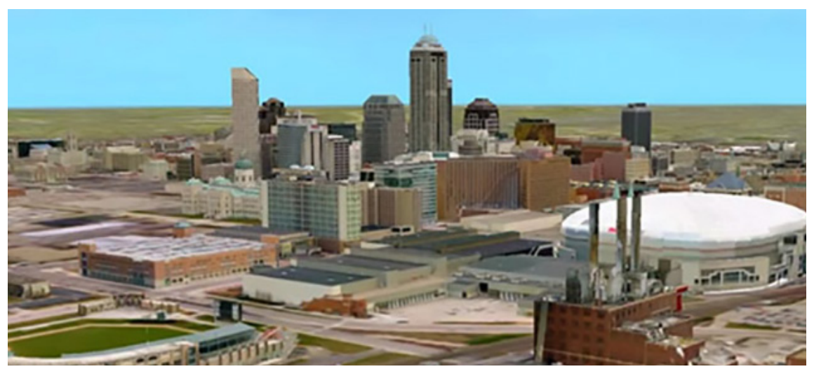
Benefit from the photo-realistic view of your assets, including the ability to fly through and evaluate areas of interest from all perspectives.

Asset management – GeoMedia's ability to bring point clouds directly into the 3D environment alongside the GIS data creates new opportunities to precisely locate, update and monitor the condition of assets in the field.